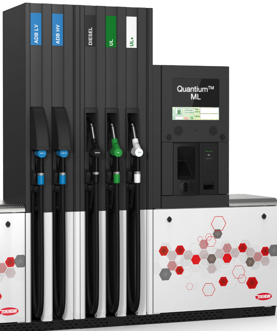
Tokheim Quantum™ ML AdBlue® dispenser

The highly configurable Quantum ML AdBlue® dispenser is here to meet the fueling demands of today and tomorrow. Thanks to our trusted Tokheim quality delivering reliable operation, this dispenser delivery lower total cost of ownership (TCO), has greater uptime than other pumps on the market, thanks to a reduced need for maintenance intervention.